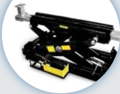
Rolling Bridge Jack