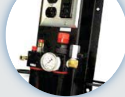
Air / Electric Work Station 5210436