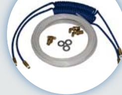
Rolling Bridge Airline Kit 5174010