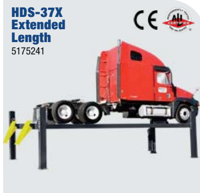
HDS-37X Extended Length 5175241

Lifting Capacity - 37,000 lbs. Max. Rise - 60" / Runway Length - 263" Width - 154" / Length - 297"