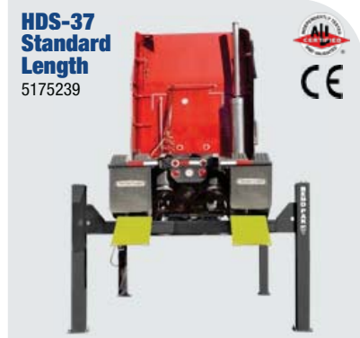
HDS-37 Standard Length 5175239

Lifting Capacity - 37,000 lbs. Max. Rise - 60" / Runway Length - 263" Width - 154" / Length - 297"