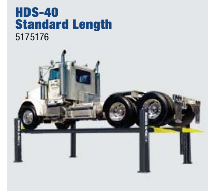
HDS-40 Standard Length 5175176

Lifting Capacity - 37,000 lbs. Max. Rise - 60" / Runway Length - 323" Width - 154" / Length - 357"