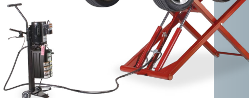
Model#: MR6 Portable Mid-Rise Lift 6,000 lb. capacity