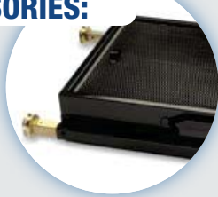
DP-30 Rolling Oil Drain 5150509