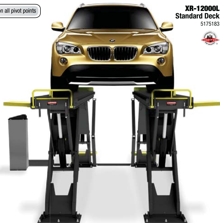
XR-12000L Standard Deck 5175183