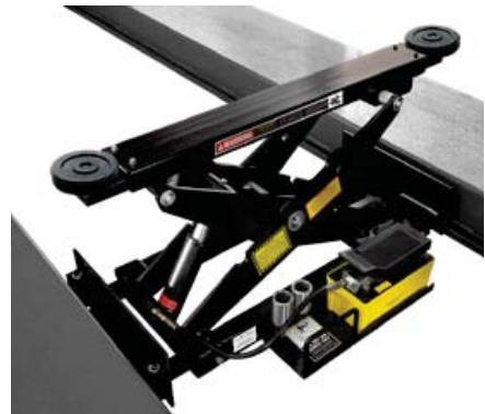
Optional RBJ6000 - 6,000 lb. capacity rolling bridge jack

GUNMETAL GRAY COMES STANDARD ON ALL BENDPAK LIFTS