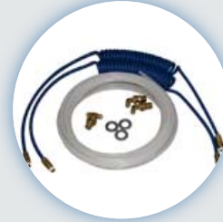
Rolling Bridge Airline Kit 5174008